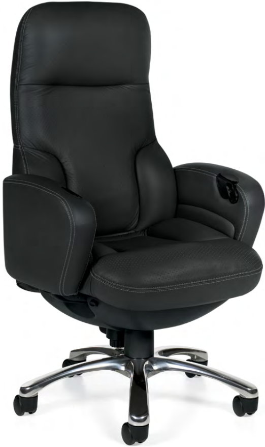
High back synchro-tilter deluxe presidential