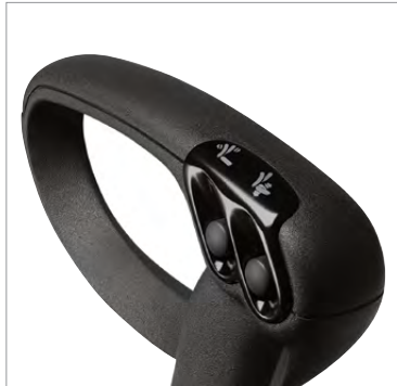
Easy to use button controls are conveniently located on the armrests