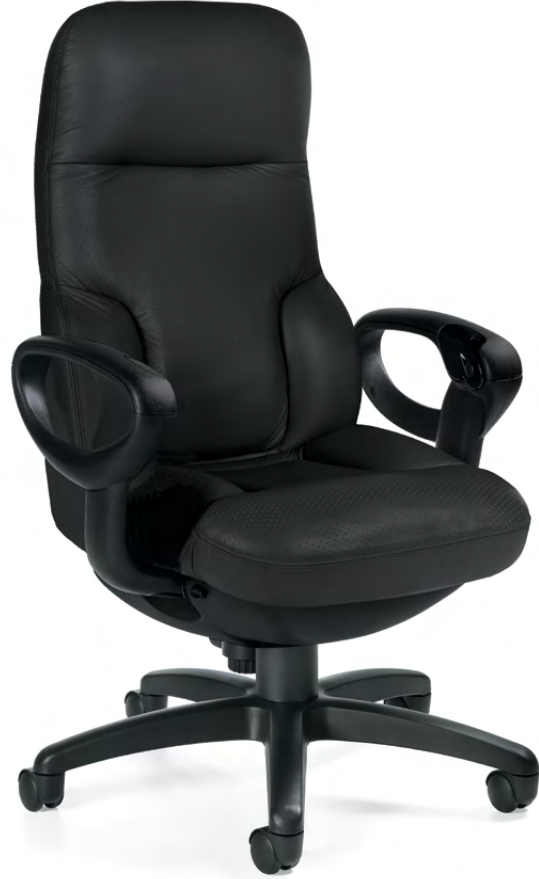
High back synchro-tilter executive 24HR

Concorde provides unique push-button control from the arm of the chair. With the click of a button the seat floats free; press again and it locks firmly in the desired seating position. The presidential model is the ultimate executive chair, with a supportive and enhanced wider seat, a tall back and contrasting stitching.