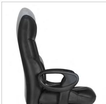
Back height adjustment