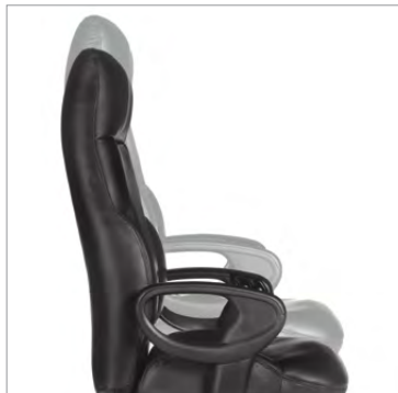
Seat height adjustment