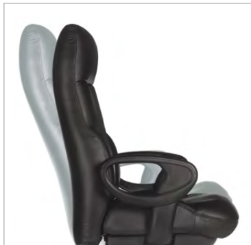
Tilt lock adjustment