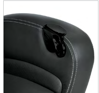
Black arm button trim