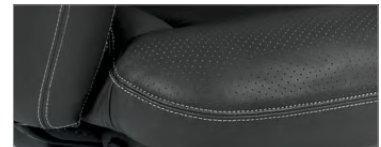
Heavy gauge contrasting stitching