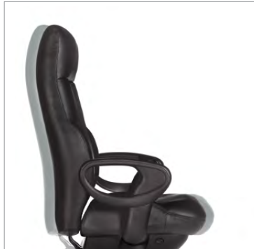
Seat slider adjustment