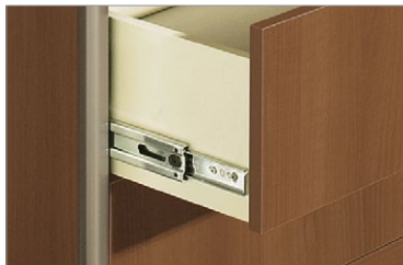
Bottom drawer interiors are vinyl wrapped and stain and moisture resistant