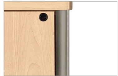
Locks are available for top drawer (key alike and master key options are available)