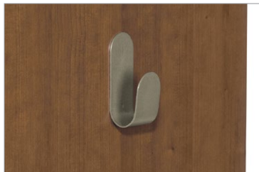
Wardrobe cabinets offer additional hanging storage with a safety garment hook