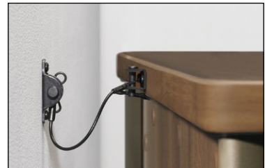
An anti-tip security kit is available and is recommended for added safety