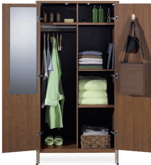
Two door wardrobe cabinet with full height hanging storage and large adjustable shelf storage.