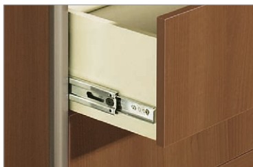
Bottom drawer interiors are vinyl wrapped and stain and moisture resistant