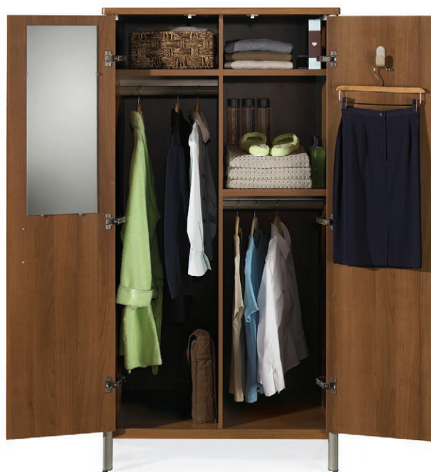
Two door wardrobe cabinet with full height and half height hanging storage and fixed shelf storage. Additional adjustable shelf is optional.