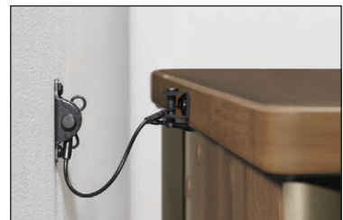
An anti-tip security kit is available and is recommended for added safety