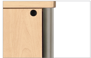
Locks are available for top drawer (key alike and master key options are available)