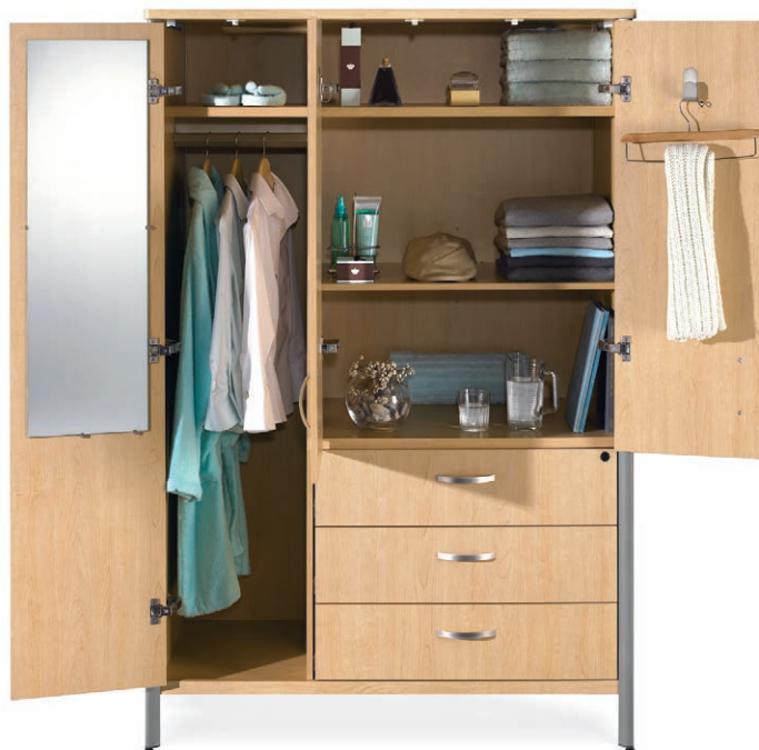
Three door wardrobe cabinet with full height hanging storage, adjustable shelf storage and three drawers with optional lock on the top drawer.