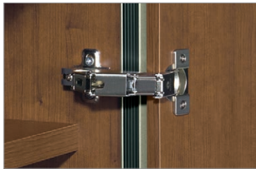
Cabinet doors are fitted with commercial quality hinges that provide 170° or full opening