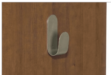
Wardrobe cabinets offer additional hanging storage with a safety garment hook