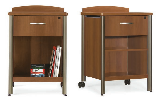
Bedside cabinet with one drawer, one adjustable shelf and optional Arc fascia

Sonoma bedside cabinets keep personal items close at hand. Choose from a selection of models with drawer, shelving and door options. The versatile cabinets are modular and align dimensionally with Sonoma wardrobes to maximize available space in the room. Sonoma bedside cabinets are elevated off the floor to simplify housekeeping and support infection control practices.