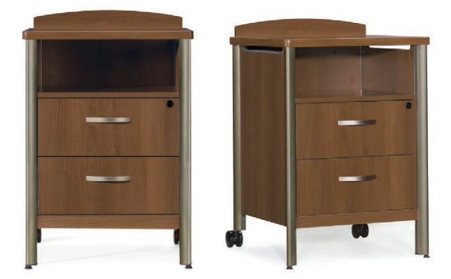
Bedside cabinet with one fixed shelf, two drawers and optional Linear fascia

Bedside cabinet with one adjustable shelf and optional Arc fascia