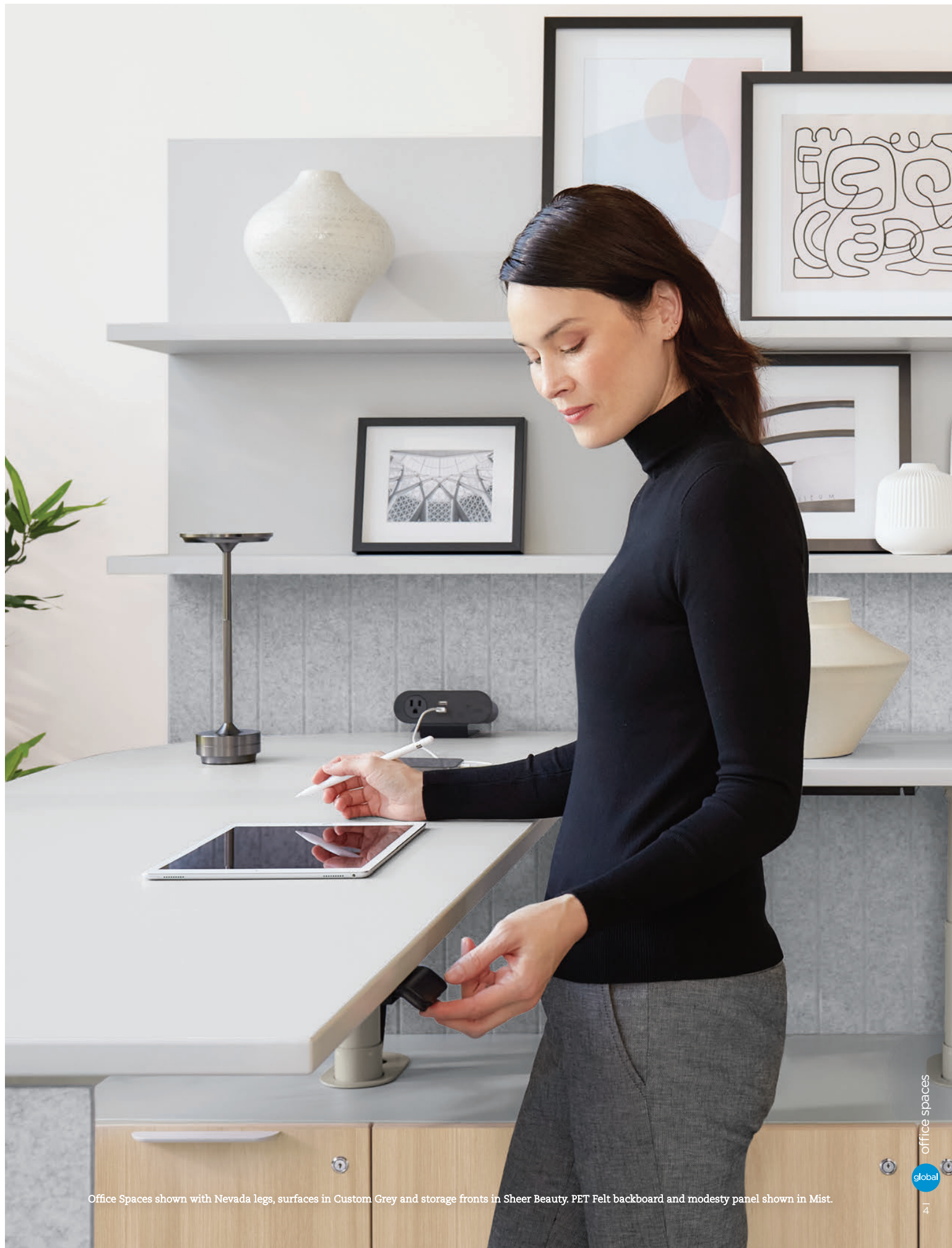
Office Spaces shown with Nevada legs, surfaces in Custom Grey and storage fronts in Sheer Beauty. PET Felt backboard and modesty panel shown in Mist.