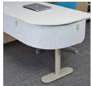
PET Felt modesty panel