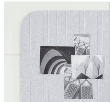
Tackable PET Felt (patterned shown)