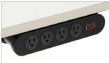
Below surface power bars (double-sided bar shown)