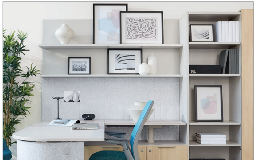
Backboards with shelves