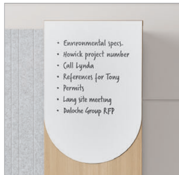
Magnetic whiteboard (optional)