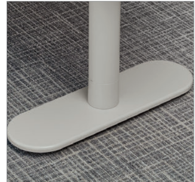
Fixed or height adjustable legs support worksurfaces and returns