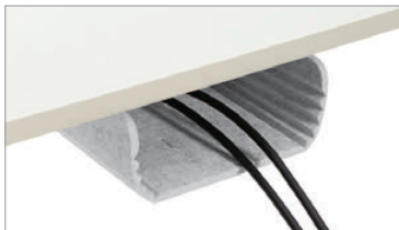
PET Felt wire manager