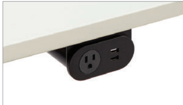
Below surface power modules (1 AC, 2 USB-A shown)