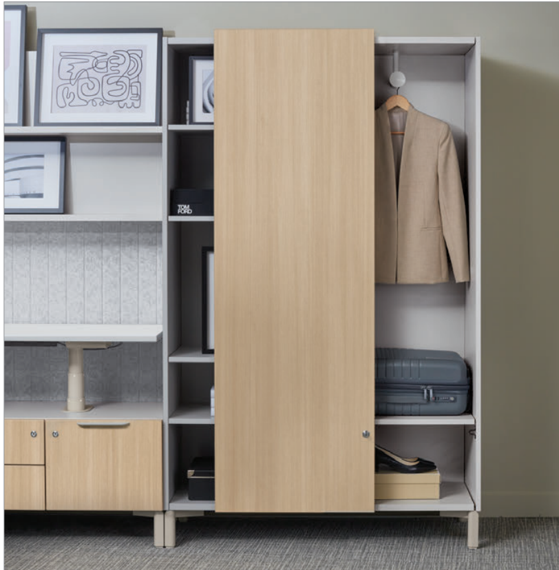
High storage with sliding door