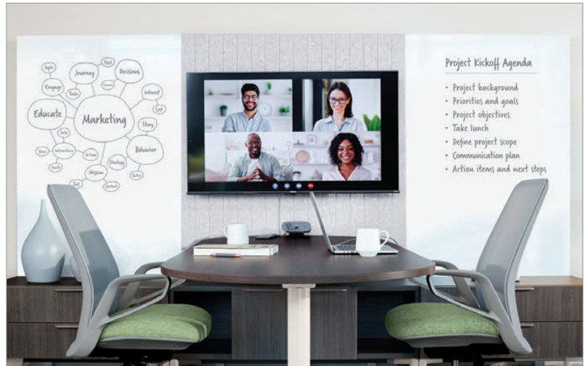
Backboards available with tackable PET Felt, laminate or whiteboard surfaces and support media displays