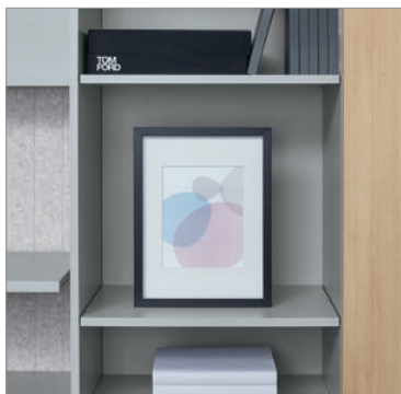
Height adjustable shelves