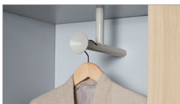
High storage coat hook/coat rail