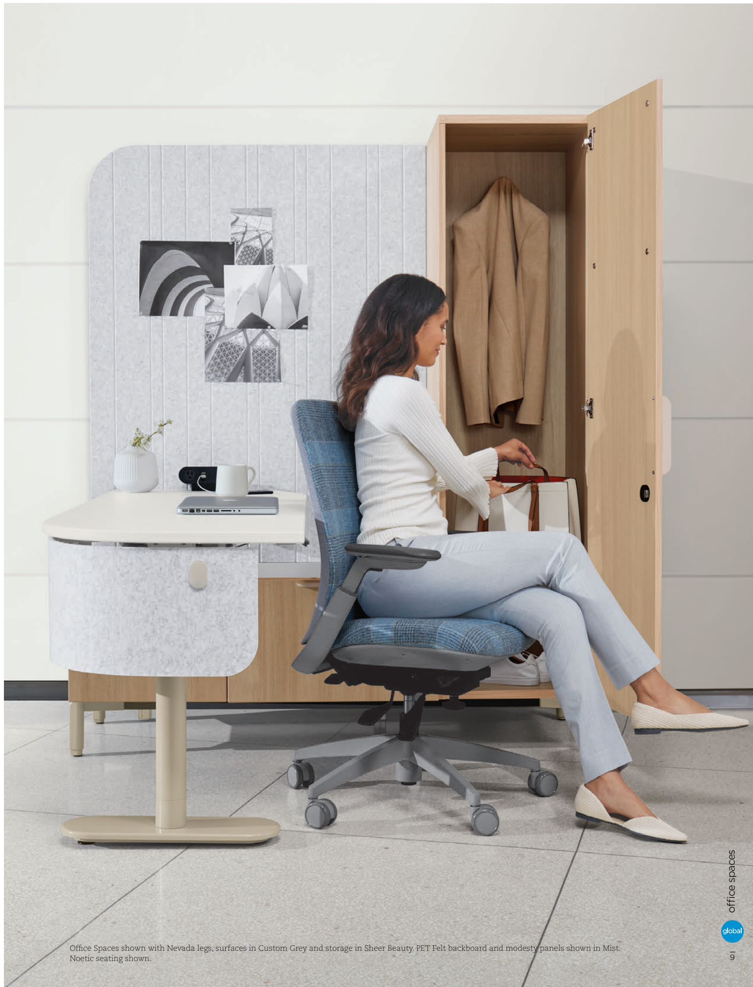
Office Spaces shown with Nevada legs, surfaces in Custom Grey and storage in Sheer Beauty. PET Felt backboard and modesty panels shown in Mist. Noetic seating shown.