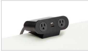
Edge/clamp mount power modules (2 AC, 2 USB-A shown)