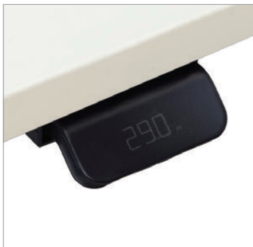
Control unit on height adjustable surface