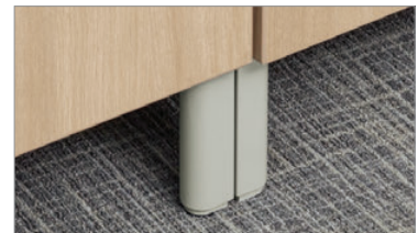
Storage leg with leveler