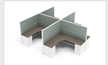
Option 3 • $2806.00 EVPCEPS424 • x1 EVPCEPSA324 • x1 EVPEERSA24 • x5 EVPFE2436 • x12 EVPIECS24 • x6