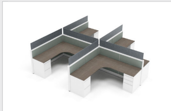
Option 2 • $888.00 EVFDK1236P • x12