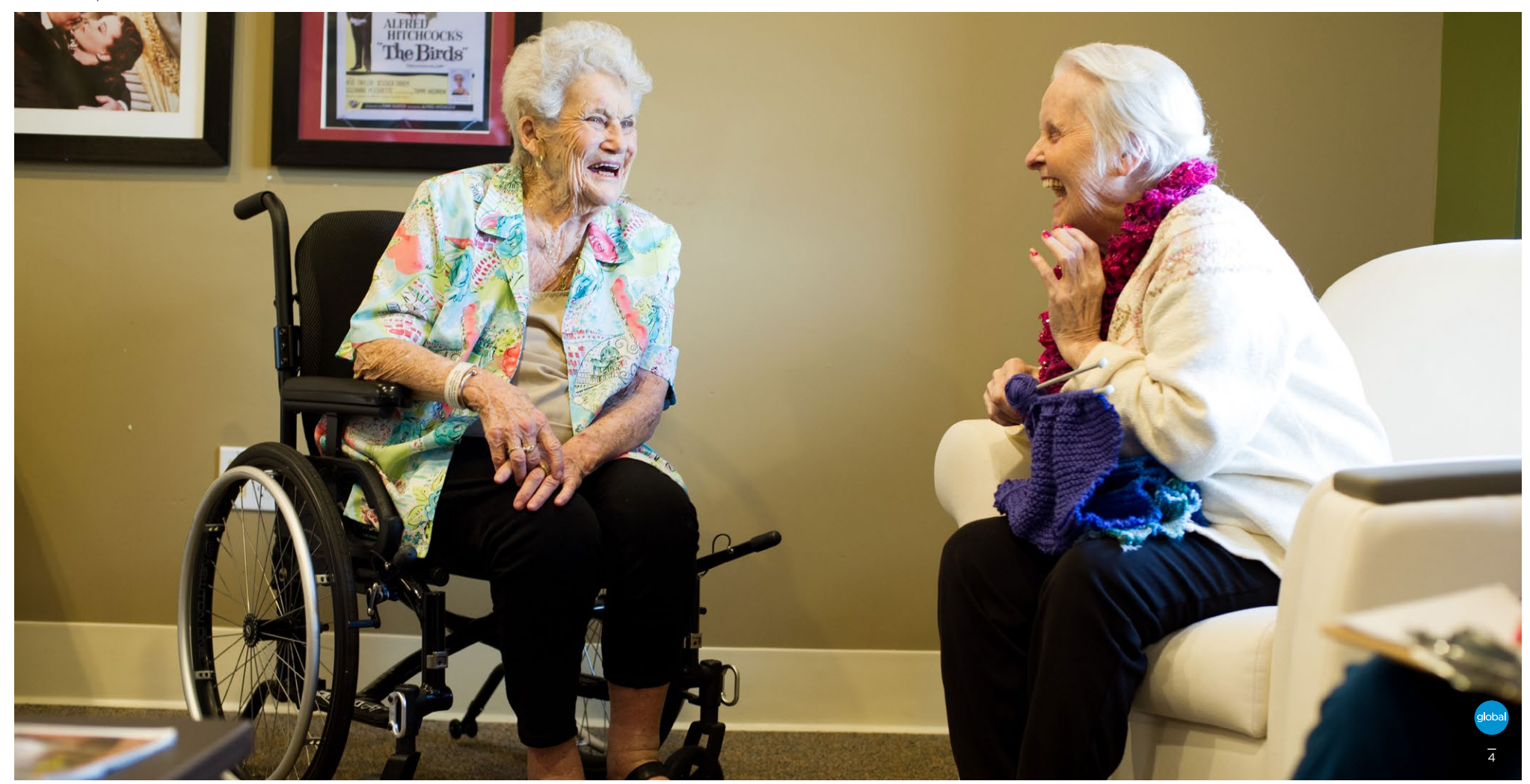
St. Joseph's Lifecare Centre