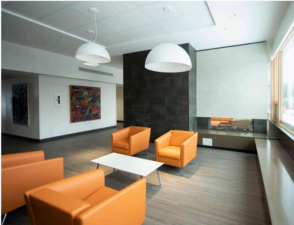
Nipissing Serenity Hospice