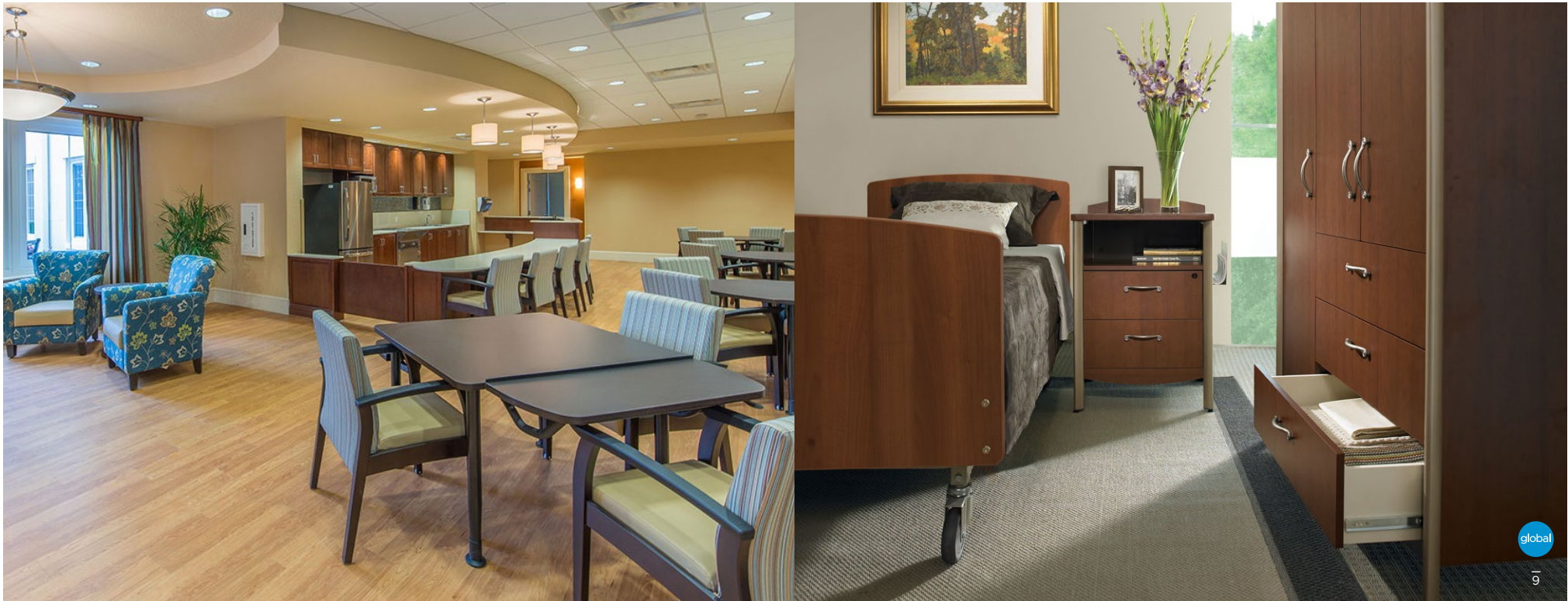
Encore at Avalon Park Assisted Living & Memory Care