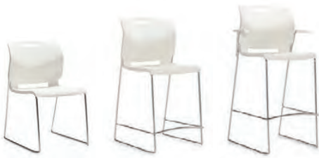
Popcorn armless chair with upholstered seat and polypropylene back; armchair with polypropylene seat and back; armless chair with polypropylene seat and back; armless counter stool with polypropylene seat and back; and bar stool with arms, polypropylene seat and back.