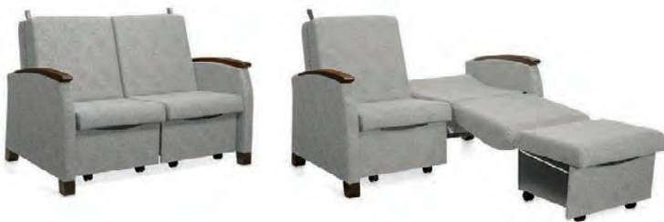
Primacare wide single sleeper and wide double sleeper.