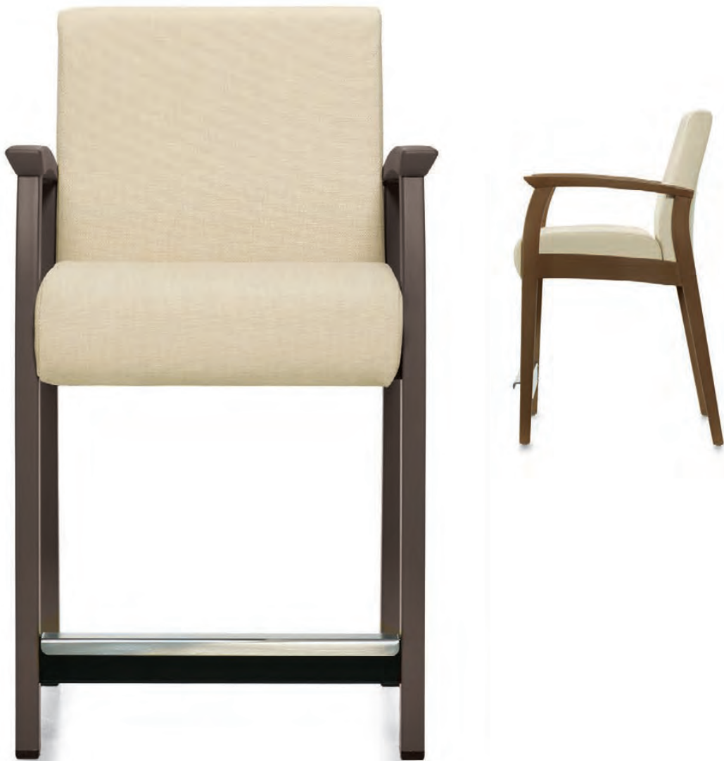
Primacare HT patient low back hip chair with open arms and Primacare patient low back hip chair with open arms.

Primacare™ hip chairs take full advantage of Primacare's superior engineering and construction, including a higher seat, step rail and a more generous seat width for patients transitioning from surgery.