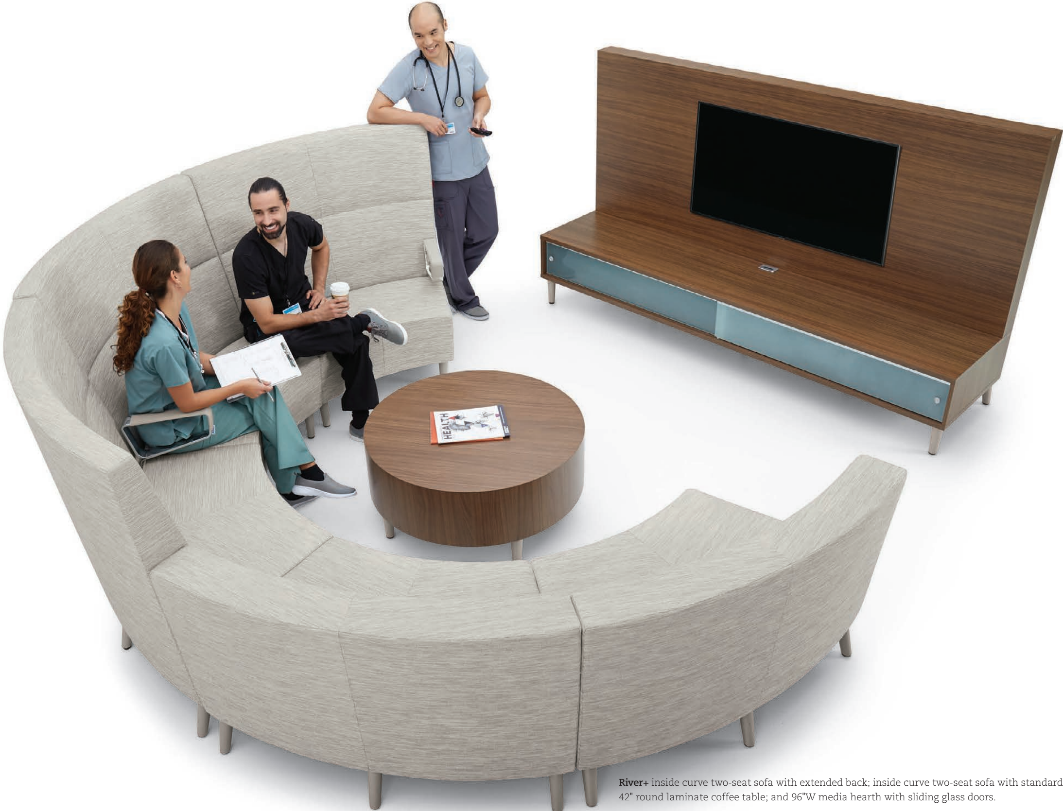
River+ inside curve two-seat sofa with extended back; inside curve two-seat sofa with standard back; 42" round laminate coffee table; and 96"W media hearth with sliding glass doors.

The series offers three back heights, multiple seat heights, and supports linear, curvilinear, 90-degree and 120-degree configurations. Elegant polished aluminum arms are fully modular and can be installed and relocated on-site to add support where required and adapt when needs change.