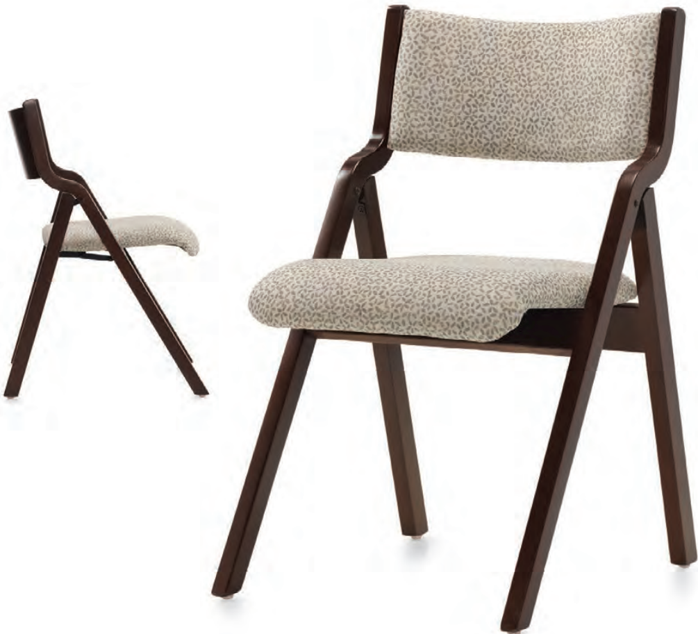
Janna folding chair with upholstered seat and back, and folding chair with upholstered seat and wood back.

The unique folding frame on Janna® makes it the perfect solution for temporary seating, especially where space is at a premium. An optional wall bracket allows the chair to be conveniently stored while not in use. Available in your choice of an upholstered or wood back.