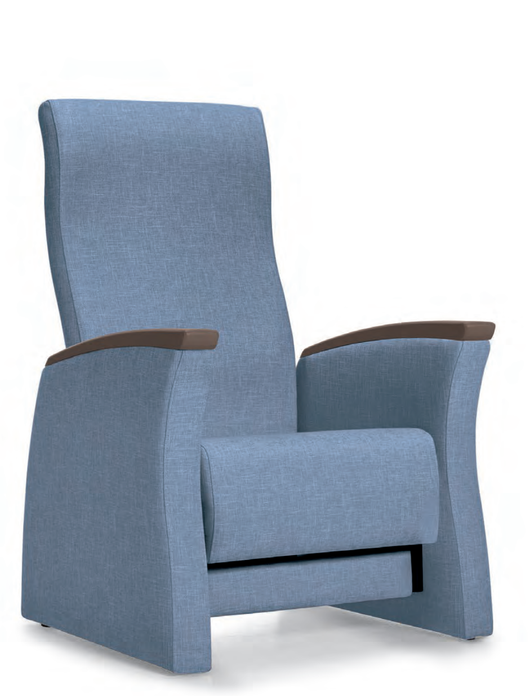
Coast glider/motion chair.

Be comfortable in Coast™. The Coast glider offers a smooth low-range rocking motion to help users relax. Designed with safety in mind, Coast's uniquely curved armrests remain stationary to provide a safer way for the user to get in and out of the chair.