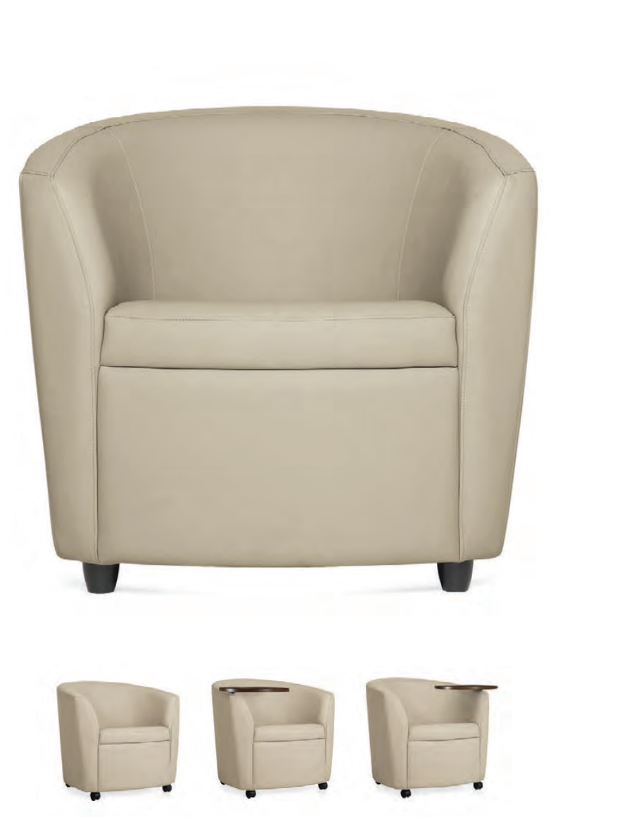
GC Sirena club chair; club chair with casters; club chair with right laminate tablet and casters; and club chair with left laminate tablet and casters.

A modern take on a classic design, GC Sirena™ remains just as relevant a design as ever. The chair's charm and diversity offer simple, clean, flexible lines that will complement and create a sense of warmth in any room.