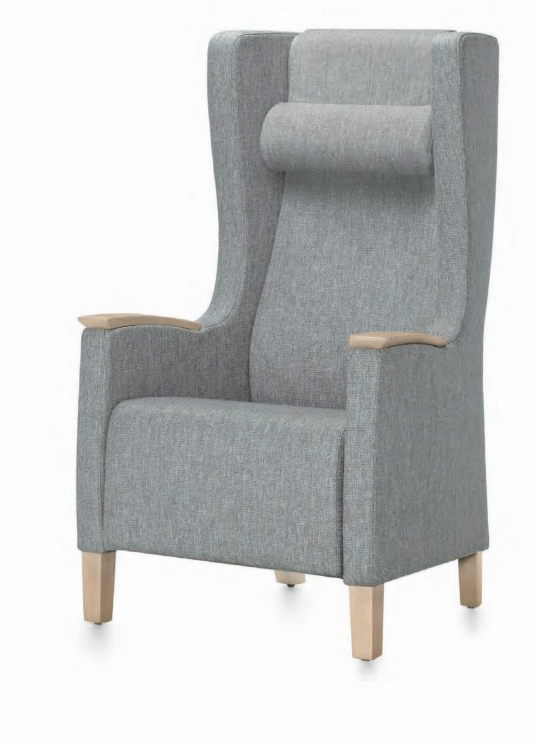
Primacare single seater wingback armchair with headrest.

Primacare™ wingback has a healthcare compliant design that includes seat clean out, adjustable neck support cushion, integrated lumbar support and forward grasping armcaps in wood or urethane. Primacare wingback is available in standard, bariatric and two seater models with optional ottomans.