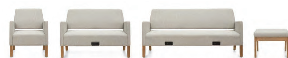
Calidon wood lounge single seat with closed arms and optional power/USB; 22" square end table; 36" square coffee table; wood lounge three seater with closed arms and optional power/USB; wood lounge two seater with closed arms and optional power/USB; and single seat bench.