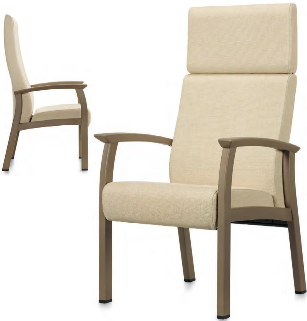
Primacare HT patient high back chair with open arms and patient high split back chair with open arms.