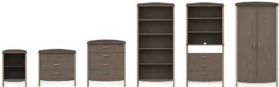
Sonoma bedside cabinet with three drawers, pull out shelf and rear casters; bedside cabinet with adjustable shelf and rear casters; three-drawer dresser; four-drawer dresser; bookcase with five shelves; open hutch with fixed and adjustable shelves, three-drawer dresser with open storage space; and two-door wardrobe with fixed and adjustable shelves, full height storage. Corian® surface available.

Aldon™ offers an affordable and personalized solution for patient and resident room furniture. Bedside cabinets and wardrobes are available in a variety of configurations. Aldon dressers are available with full-width or half-width drawers for shared use in double occupancy rooms.