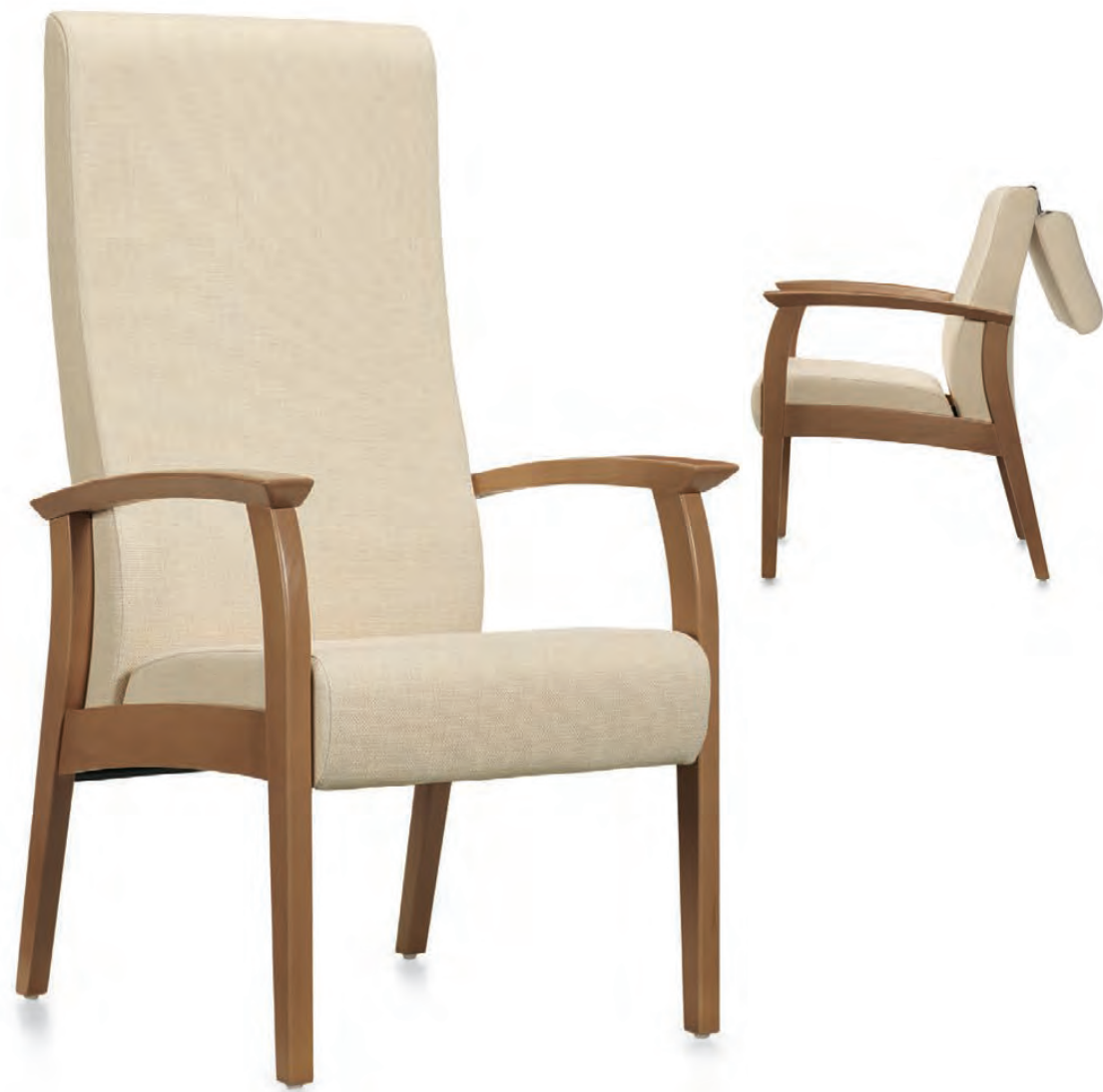
Primacare patient high back chair with open arms and patient high split back chair with open arms.

A better fit. Primacare™ patient seating features an ergonomically-contoured back and built-in lumbar support, which can be enhanced with a flexing back for increased comfort or a fold-down upper back that enables caregivers to assist patients safely. “Tip and move” rear casters are optional on HT models, allowing the chair to be moved easily within the space (not for patient transfer).