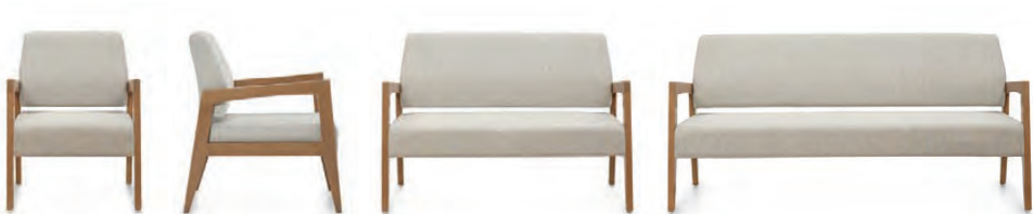
Wood lounge single seat with open arms; wood lounge two seater with open arms; and wood lounge three seater with open arms.