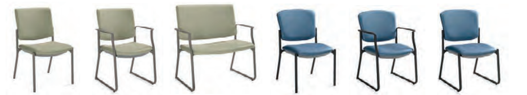
Frolick armchair with rectangular back and concealed attachment; side chair with rectangular back and concealed attachment; armchair with rectangular back, concealed attachment and sled base; and bariatric armchair with rectangular back and sled base. Splash fan back four-legged armchair with concealed attachment; fan back four-legged side chair with concealed attachment; fan back armchair with concealed attachment and sled base; and fan back side chair with concealed attachment and sled base.