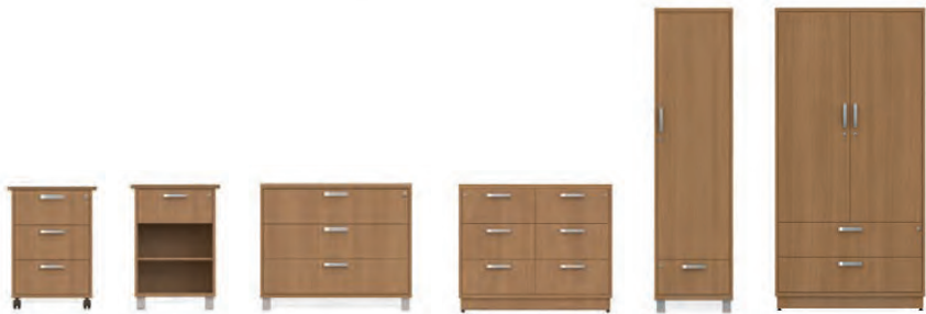
Aldon bedside cabinet with drawer, right opening door and metal legs; bedside cabinet with three drawers and casters; bedside cabinet with drawer, adjustable shelf and metal legs; dresser with three drawers and metal legs; double dresser with six half drawers and plinth base; narrow wardrobe with drawer, fixed upper shelf, coat rail and metal legs; and divided wardrobe with two drawers, fixed upper shelf, coat rail and plinth base. Corian® surface available.