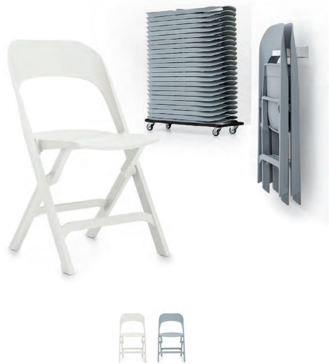
Flap folding chair; dolly for Flap folding chairs; and wall hook.

When rooms are planned to optimize space, accommodating extra people can be challenging. Flap™ is a versatile seating solution that can expand the audience quickly. Lightweight and stackable, UV stable, weather and stain resistant, Flap folds flat for storage or can be hung in pairs on a wall hook (optional). The technopolymer molded construction ensures Flap can be used safely in MRI rooms.