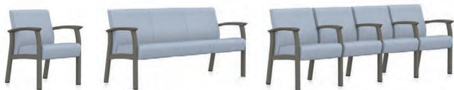
Primacare HT guest low back single seater with open arms; guest low back three seater with open arms; and guest low back four seater with open center arms.