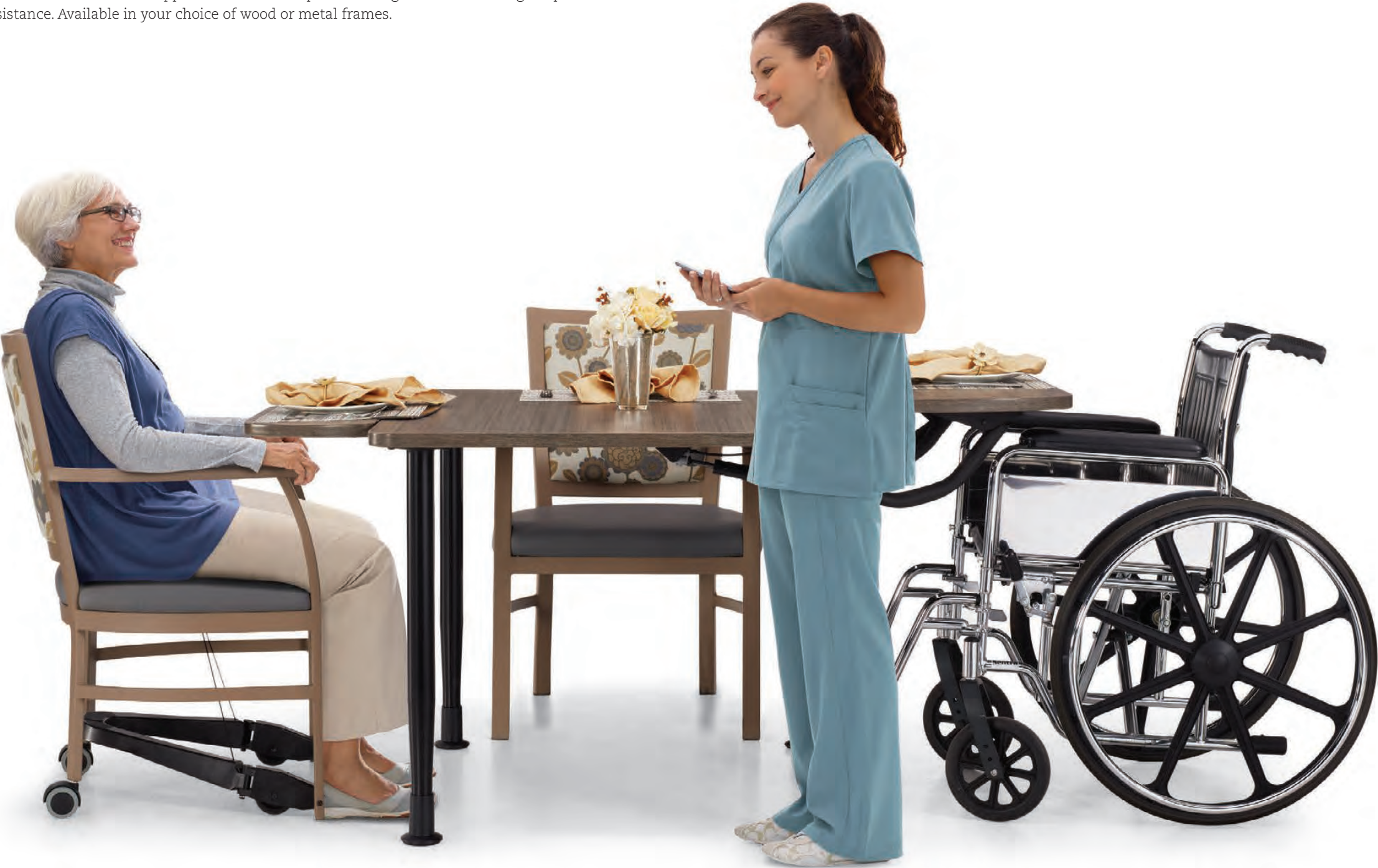
Desmond HT metal armchair with lift mechanism and rear swivel casters; and metal armchair. Enable table multi-purpose table with high pressure laminate top, fixed height and E-Z lift dual arm tablets in high pressure laminate.

Make it comfortable. Desmond™ dining chairs have been sized specifically to suit both elder care and acute care applications with an optional lifting function for caregiver patient assistance. Available in your choice of wood or metal frames.