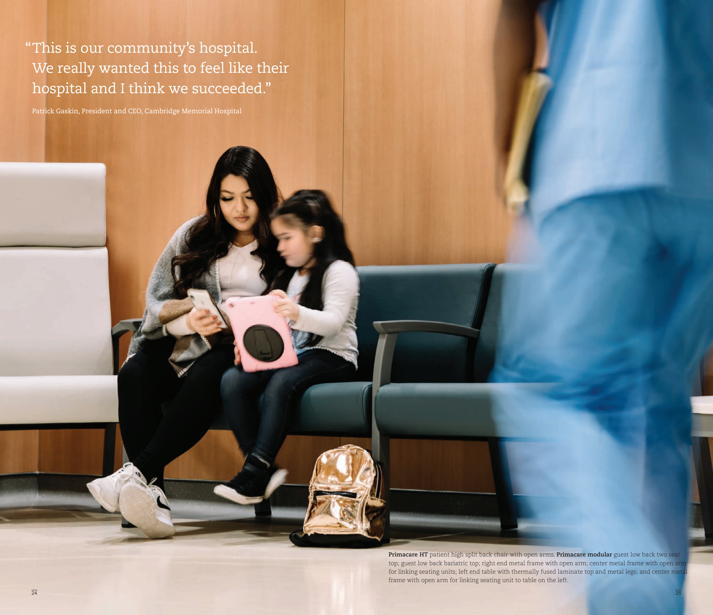
Primacare HT patient high split back chair with open arms. Primacare modular guest low back two seat top; guest low back bariatric top; right end metal frame with open arm; center metal frame with open arm for linking seating units; left end table with thermally fused laminate top and metal legs; and center metal frame with open arm for linking seating unit to table on the left.

Patrick Gaskin, President and CEO, Cambridge Memorial Hospital