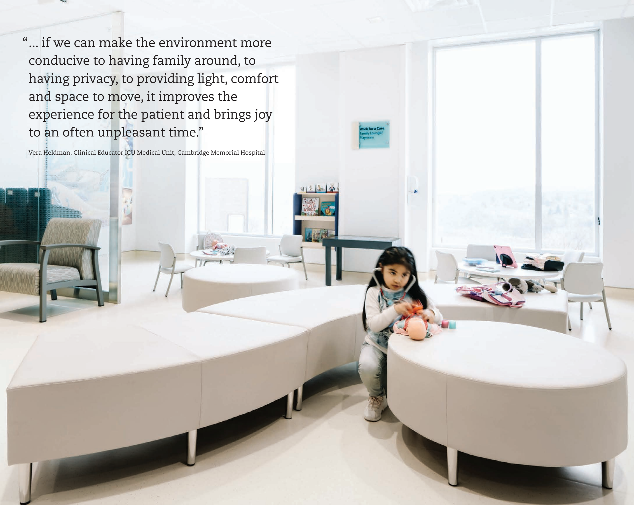
Primacare HT lounge chair with open arms. GC Sidero side chair, 13" high seat. River+ outside curve two-seat bench; inside curve two-seat bench; and 42" round bench.

Vera Heldman, Clinical Educator ICU Medical Unit, Cambridge Memorial Hospital