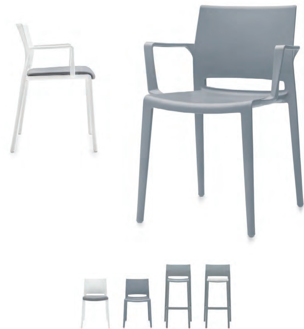
Bakhita armchair with upholstered seat and polymer back; armchair with polymer seat and back; side chair with upholstered seat and polymer back; side chair with polymer seat and back; armless bar stool with polymer seat and back; and armless bar stool with upholstered seat and polymer back.

Bakhita™ is designed to look good and perform well. Bakhita is constructed of two techno polymers for strength, has UV additives for outdoor exposure and contains no steel hardware, making it a nonferrous product perfect for rooms housing MRI technology.