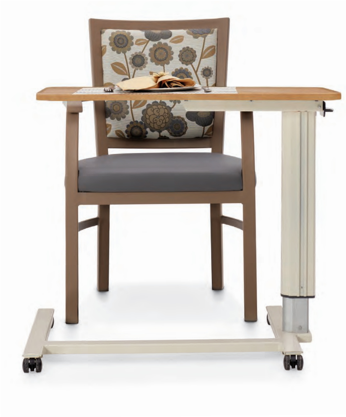
Overbed tables rectangular thermofoil spillguard top with flip-top surface, U-base and vanity drawer; peanut shaped thermofoil spillguard top with C-base; kidney shaped thermofoil spillguard top with C-base and Desmond HT metal armchair.