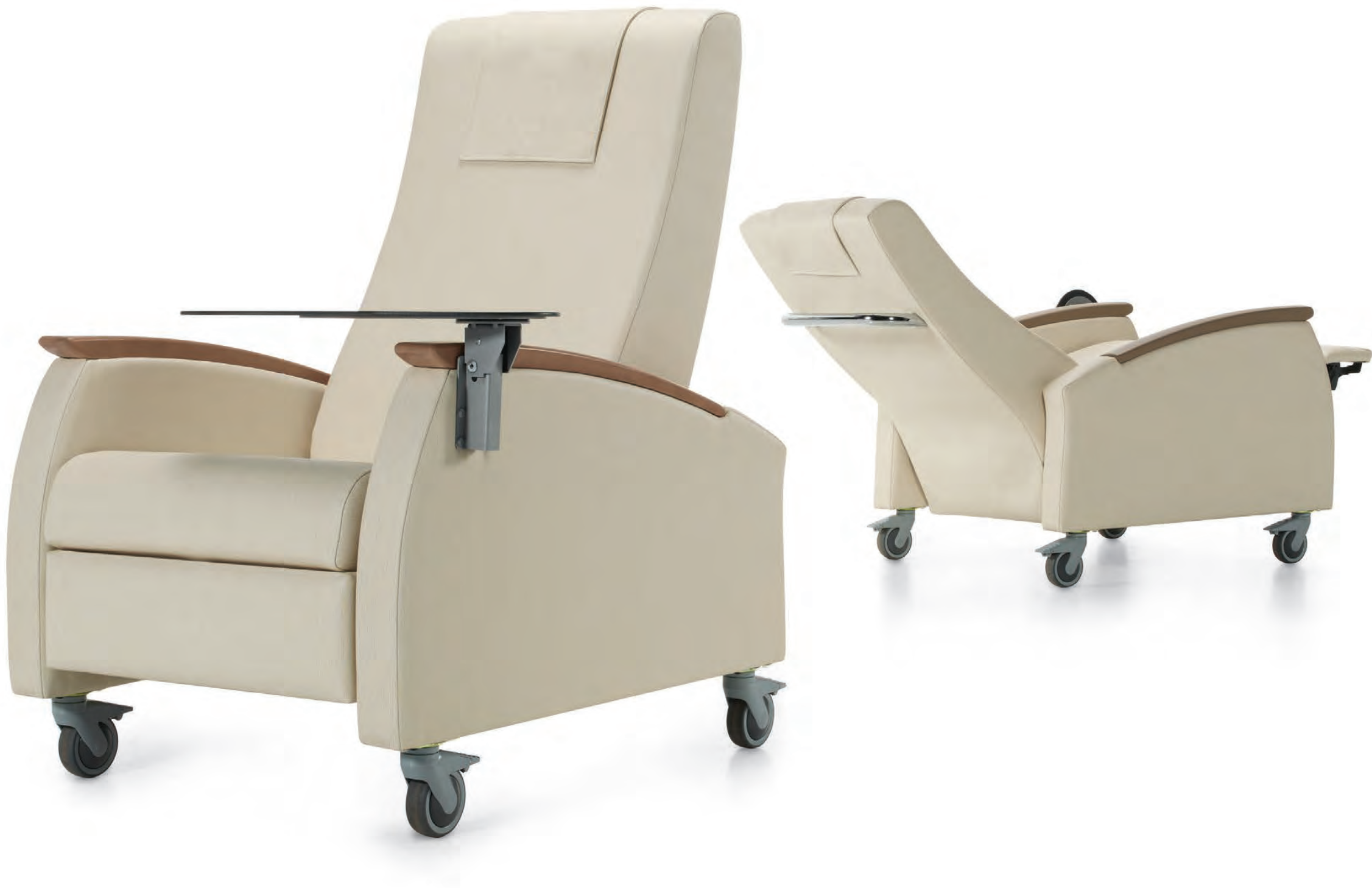
Primacare motion recliner with solid wood armcaps, casters and optional tablet arm.

Better by design. Primacare™ motion recliners follow the patient's intuitive response to reach for the arms when they want to come to a seated position. This simple action overcomes patient stress and concerns if a caregiver is not immediately available.