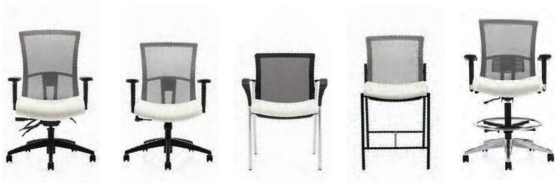
Vion mesh high back synchro-tilter; mesh back bar height stool; mesh high back multi-tilter; mesh medium back tilter; mesh low back side chair; armless mesh back counter height stool; and mesh medium back height adjustable task stool.

Vion is no ordinary office chair. Designed by Zooey Chu, its unique back provides exceptional comfort throughout the workday. Add the optional lumbar support and you just might never leave your workplace.