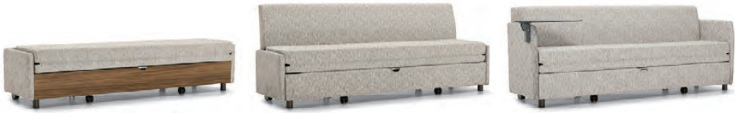
Dreme sleeper with back, arms and laminate front; armless sleeper with laminate front; armless sleeper with back; and sleeper with back, arms and tablet.