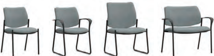
GC Sidero low back mid size armchair; low back armchair; low back side chair; low back armchair with sled base; high single-piece back mid size side chair with sled base; and low back bariatric armchair.