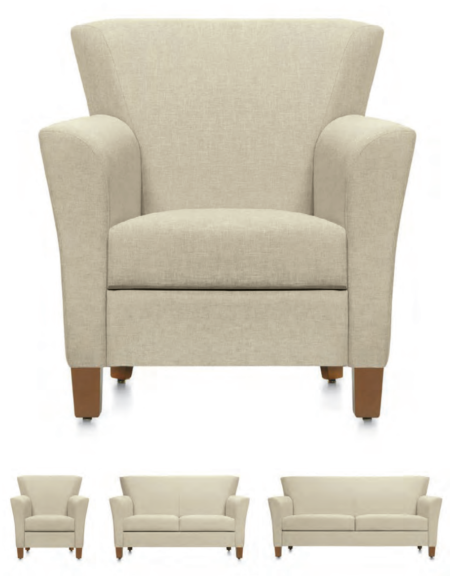
Senator armchair, two seat sofa and three seat sofa.

Senator® adds a modern look to the wingback chair with gracious curves and a high back for support. Spaces designed for relaxation will look richer and more beautiful when choosing the Senator series.