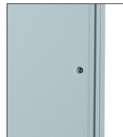
Looped full pull