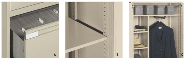
A. One-piece top adds strength. B. Shelf insert. C. Multiple wardrobe configurations.

Global provides Wardrobes and Multi-storage that are matching storage to all of its series; whether its our best 9100 Plus, or 9100 series. We provide different looks, and options to meet your changing needs.