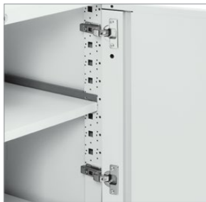
Hinge detail / interior

Available in all Global standard colors and textured colors. Metallic and special colors are available, additional charges will apply. Please refer to our website or the Metal Filing + Storage price list for more information.