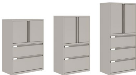
GUCC41G18xxP 4 high cabinet