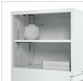
Open side access