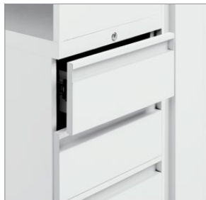
Drawers overlap casing