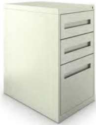
C-Series - Full Pull