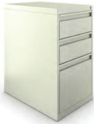
Evolve - Loop Pull