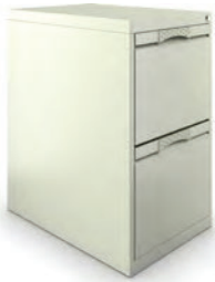
Linear - Soft-to-the-Touch Pull