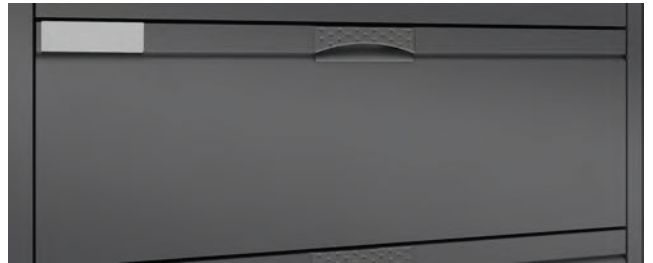
Linear - Soft-to-the-Touch Pull