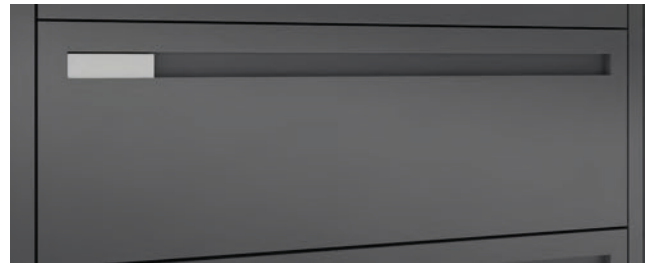
C-Series - Full Pull

Mobile pedestals are available with optional Cushions.