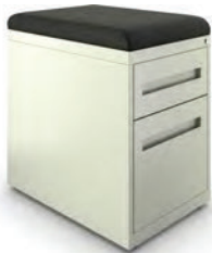
C-Series - Full Pull

Mobile pedestals are available with optional Cushions.