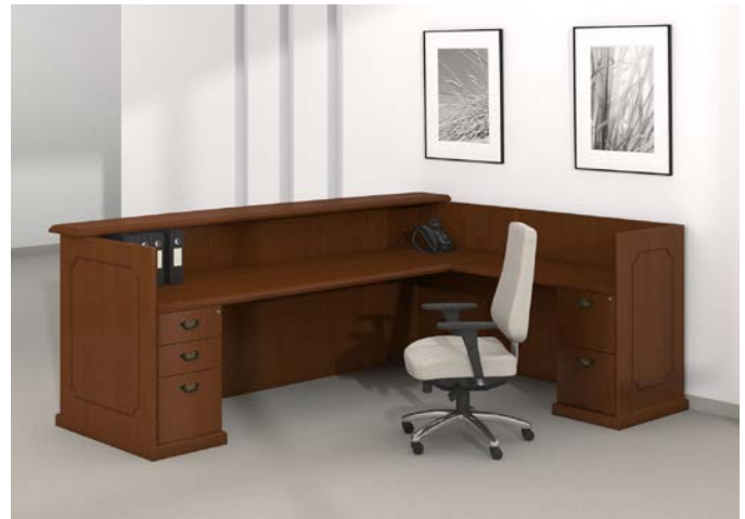
Top: Reception desk, cabinet and hutch shown in Red Cherry (RCW). Bottom Left and Right: Reception desk shown in Warm Cherry (WCW).