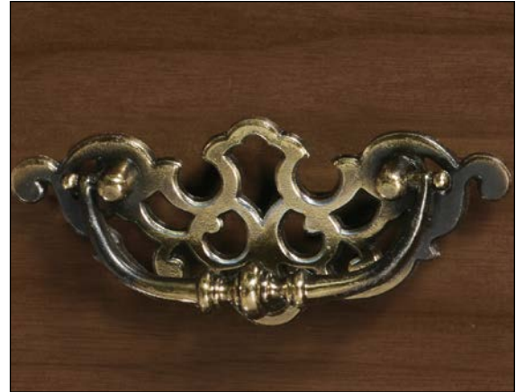
Antique brass pull