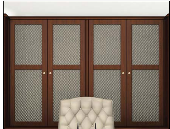
Wood framed wire mesh doors