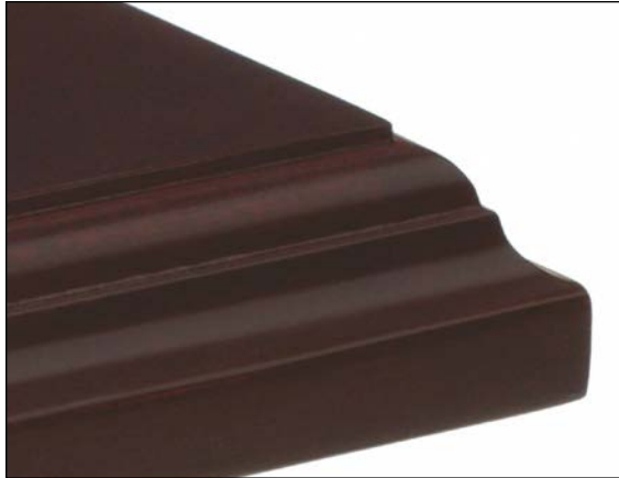
1 3/8" thick solid hardwood edge