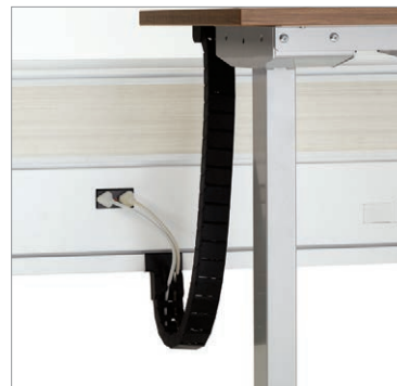
Optional energy chain manages power and data from the raceway to any table