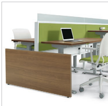
Laminate end panels available in 24", 30" and 36" heights (24" shown)