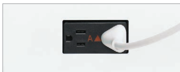
Duplex receptacle available in Black and White