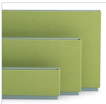
Fabric, laminate or glass extension kits available in 6", 12" and 18" heights