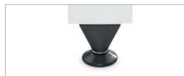
Leveling glides offer 1" adjustability