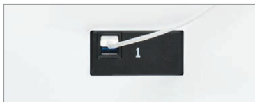
USB duplex available in Black and White