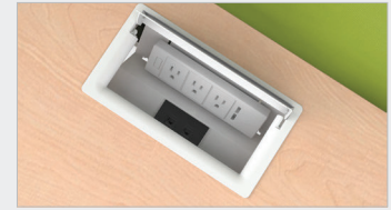
Cable tray with access door open showing power and USB module.