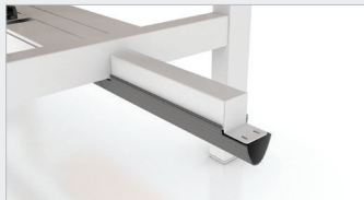
Table to table connector includes housing to housing harness.