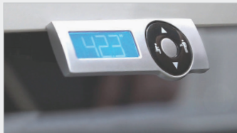
Optional: Joggle handset with digital backlit display