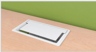
Cable tray with access door closed