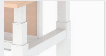
Extended height ranges from 22.57" to 48.75". Standard height ranges from 27" to 45".