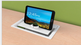
Optional lid mount device holder