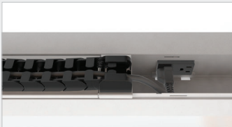
Eight wire power trough with energy chain