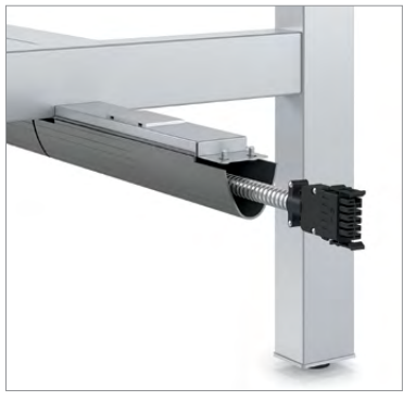
Table to table connector includes housing to housing harness