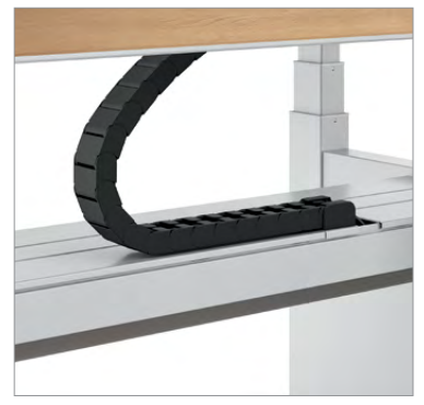
Cable chain manager connects table with power trough