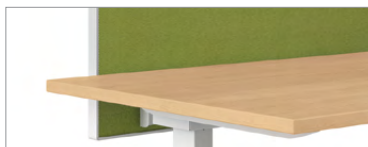
Table mounted screens