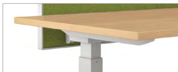
Nested column (2-stage shown)