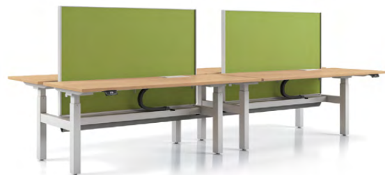
Stationary framed divider

Support individual control and personalization without impeding collaboration. Integrate height adjustability along a bench where you need it, while maintaining a unified aesthetic.