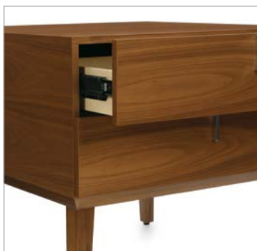
Drawers with wood interior.