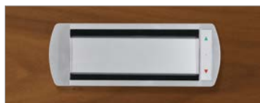
Power block in table top, closed.