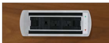
Power block in table top, open.