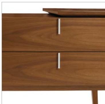
Peninsula table connects to a pedestal.