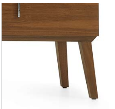
High leg on credenzas, pedestals and freestanding storage.