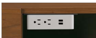
Undermount power block available in White or Black.