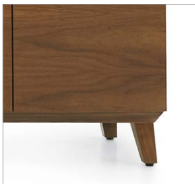
Low leg on credenzas, pedestals and freestanding storage.