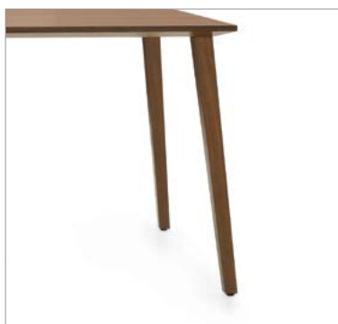
Tables available in standard or counter height.