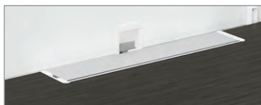
Optional power access door (full width)