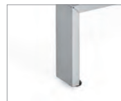
Standard leg on storage and seating