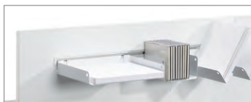
Accessory rail on laminate screens