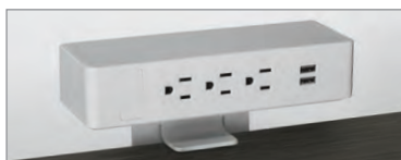
Optional worksurface edge-mounted power