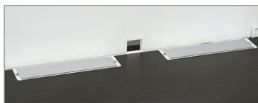
Optional power access door (split width)