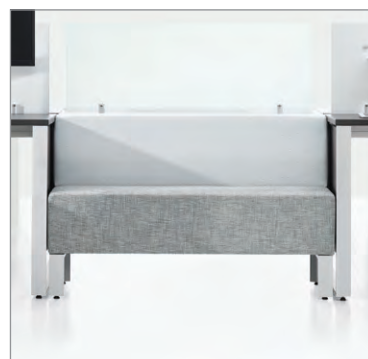
Integrated soft seating