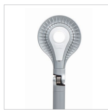
Revo task lights each contain 18 long lasting fractional LED bulbs