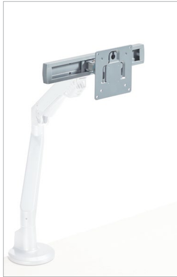
Optional mini-slide (sold separately) provides 9" of lateral adjustment when used in corners or tight spaces