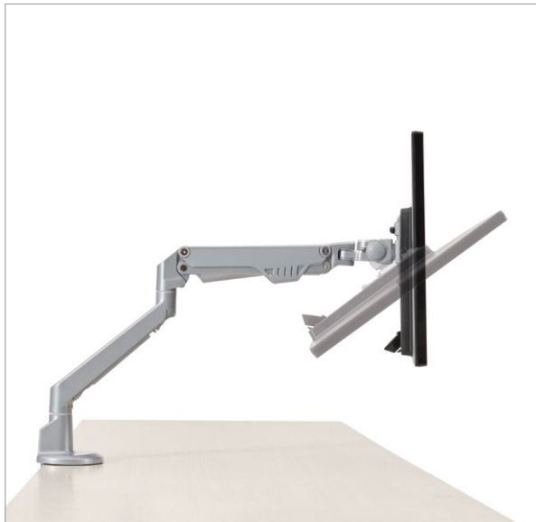
Monitor tilts +90° to -45°