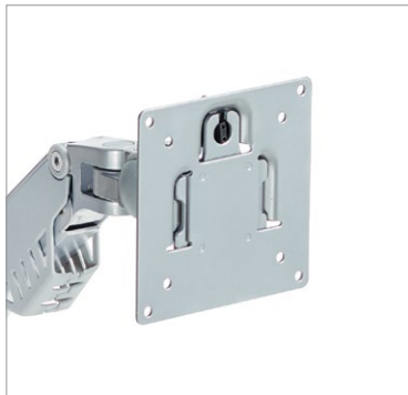
Quick disconnect plate