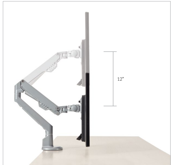
Adjust the monitor height to suit your workstyle