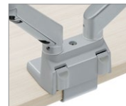
Double monitor clamp mount