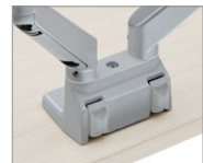
Double monitor grommet mount

Please visit globalfurnituregroup.com for additional product information including industry and environmental certifications.