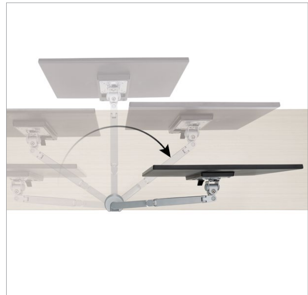
180-degree lockout feature

Additional information can be found on the Global website .