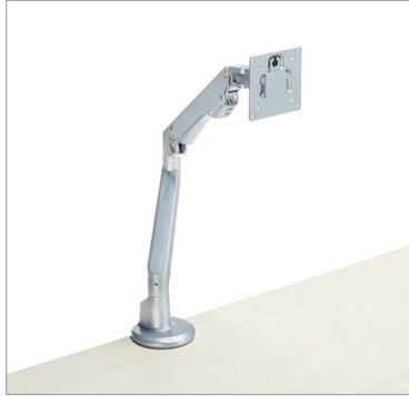
Single monitor arm (PSMA1)