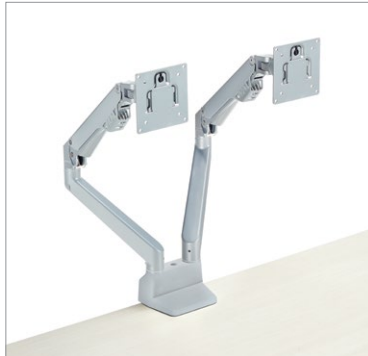
Double monitor arm (PSMA2)